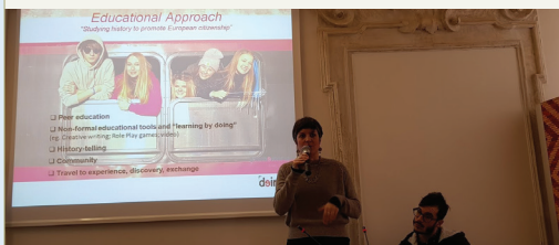
DECRA meeting in Pula, Croatia