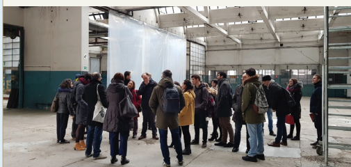
DECRA meeting in Forli, Italy

In the framework of ERASMUS + project DECRA (Developing European Cultural Routes for All) led by French Federation of European cultural routes, DCC took part at the two international thematic meetings held in Forli (Italy) and Pula (Croatia). Both meetings, held in March and April, were focused on implementation of Faro convention, emphasising its different aspects. Meeting in Forli was dedicated to social inclusion and citizen participation, while in Pula project partners discussed valorisation of local heritage and connection between culture and tourism. More detailed report is available at: